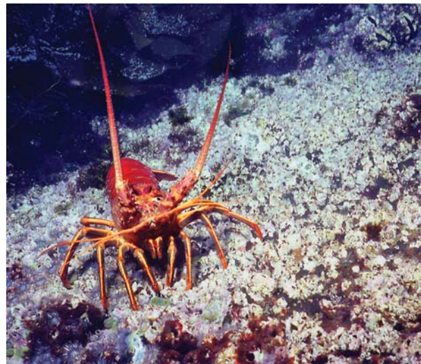
FIGURE 1 Panulirus interruptus foraging in the intertidal zone at night. Barnacles, anemones, mussels, and algae comprise the carpet of sedentary species. While foraging, spiny lobsters creep along tapping the substratum with the terminal segments (dactyls) of the forward walking legs. The dactyls pry up the prey, positioning it in front of the mouth on the ventral surface.

Perhaps as a consequence of heavy exploitation reducing their numbers, as well as their secretive habits, lobsters are seldom thought of as intertidal species. However, early accounts of the colonists made reference to Native Americans collecting copious amounts of clawed lobsters from New England tidal flats during low tide. Early twentieth century naturalists on the southwest west coast of North America remarked on the shore-loving tendencies and frequent occurrence in tidepools of spiny lobsters. Contemporary observations on shores of California Channel Islands protected from sport and commercial exploitation reveal that Panulirus interruptus remain during the day in subtidal shelters and emerge at night to forage, and if the tide is high, they may roam into the upper levels of the intertidal zone (Fig. 1). Spiny lobsters crush shelled prey with large shearing mandibles on the ventral surface. Intertidal prey include polychaetes, urchins, barnacles, turbin snails, limpets, littorines, and most frequently, mussels ( Mytilus spp.).